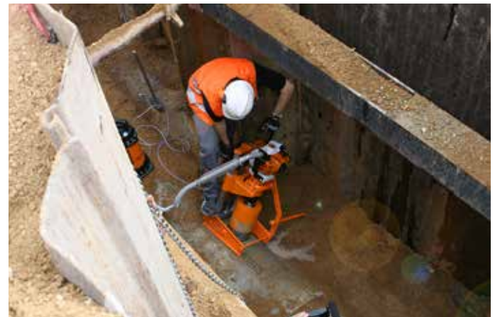
90° Drill in sewage pipe. Fixing by ground spikes