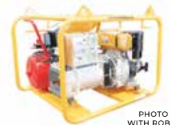
PHOTO WITH ROBIN ENGINE