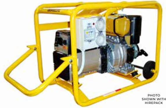
PHOTO SHOWN WITH HIREPACK

Crommelins Welder Generators are a convenient combination of Arc Welding and power generation. This unit is ideally suited to rental and agricultural industries for small on-site repairs. These models can be customised to suit your requirements.