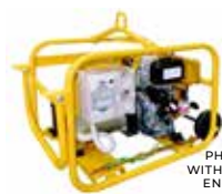
PHOTO WITH ROBIN ENGINE