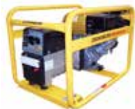
GW200RP / 3P200