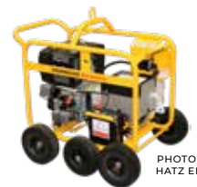
PHOTO WITH HATZ ENGINE