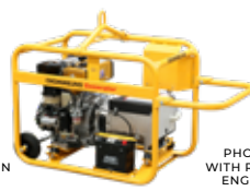
PHOTO WITH ROBIN ENGINE