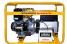
PHOTO WITH ROBIN ENGINE